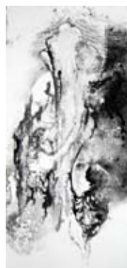
Left: Adam's Rib , monotype, 20" x 10" ©2009